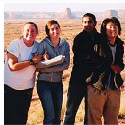
USC students visit the Navajo Nation Reservation in Utah during their 2005 spring break.

“It became the highlight of my year at SC,” he said. “I really saw it make a difference in the student’s lives. For some, the change lasted only two weeks. For others, it made a permanent difference. For many, it was their first opportunity to see what a difficult time in the world other people had.”