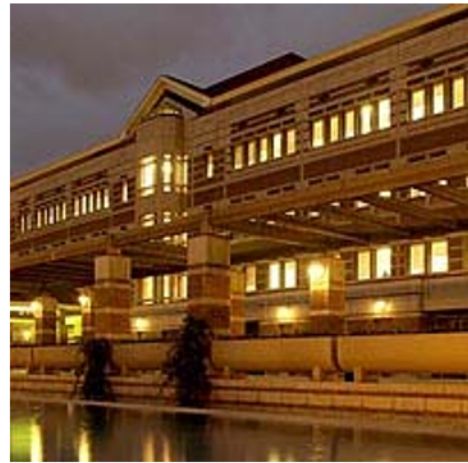
USC’s profile prominently featured the Joint Educational Project, one of the oldest service-learning programs in the country.

“These ‘JEPers’ ... receive training, guidance and assistance in bridging theory and practice from [organization] staff, who also monitor students’ progress in the field and help community supervisors in evaluating students’ work.”